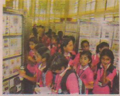
Philatelist from Brahamvar, at the philatelic exhibition, 'Karnape 2019', at TMA Hall in Mangaluru on Sunday

SPECIAL covers on Udupi Mattu Gulla, Shanikarapura mallige or Udipi mallige (Udipi jasmine) and new species of frogs from the outskirts of the city named 'Euphylyctis Aloysii' (named after St Aloysius Gonzaga) were released on the second day amid hundreds of philatelic enthusiasts during state level philatelic exhibition 'Karnape 2019', organised for the first time at TMA Hall in Mangaluru on Sunday.