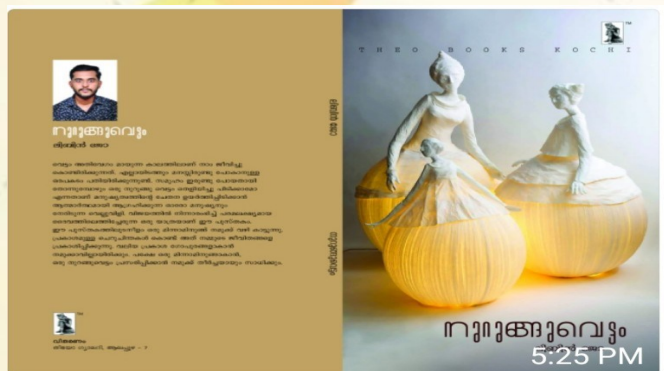
Nurungu vettam(A glimpse of light)

MOOC Courses of PG students (JMC- Journalism & Mass Communication)