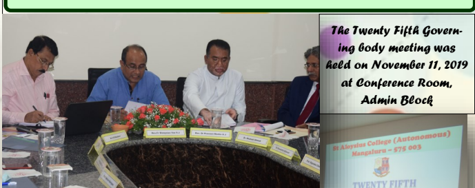
The Twenty Fifth Governing body meeting was held on November 11, 2019 at Conference Room, Admin Block