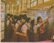
Students viewing stamps displayed during the 4-day state level philatelic exhibition in Mangaluru.