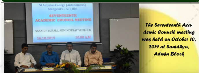
The Seventeenth Academic Council meeting was held on October 10, 2019 at Sandhya, Admin Block